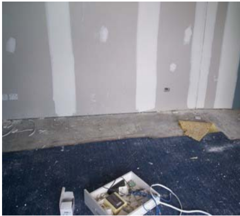
New wall built beyond carpet line

Disruption to trading is reduced significantly