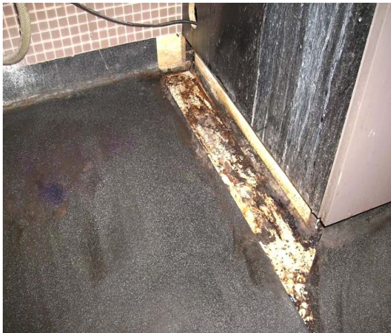
Water damaged vinyl coving

This work can be undertaken outside your normal trading hours or at any time convenient to your requirements.