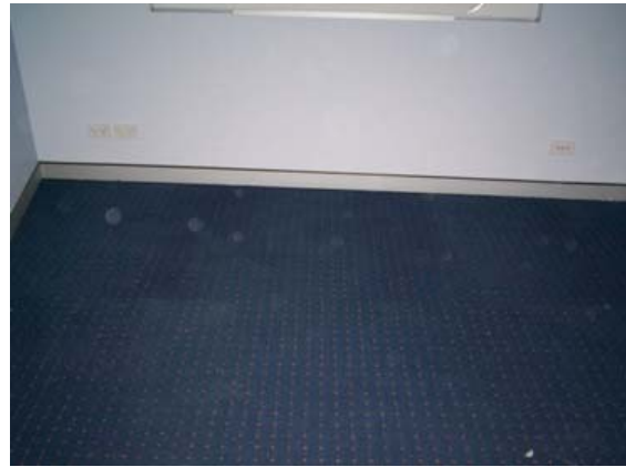
Carpet repaired/patched and reinstated