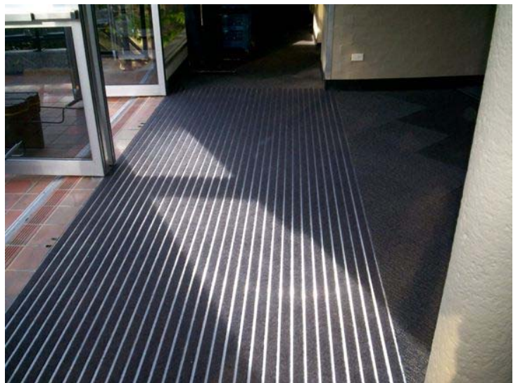
New Entrance Mat